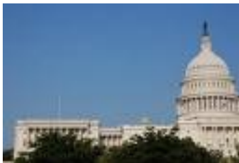
Capitol, Washington, DC